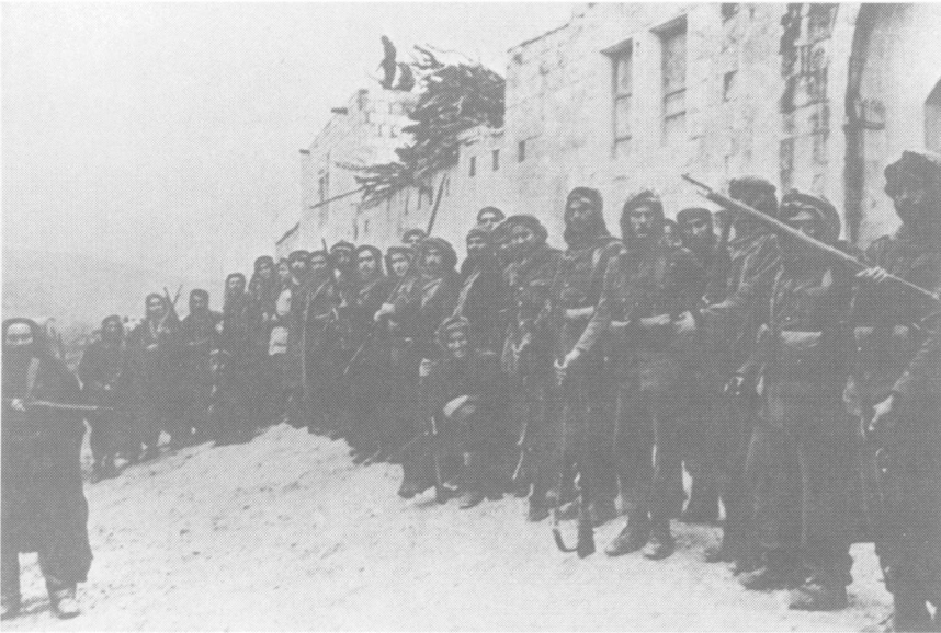
ALA troops stationed in central Palestine, March 1948.

The total of the units and contingents mentioned in paragraphs 1 and 2 above is about 5,200. Of these, some 4,000 have already entered Palestine, including contingents from Jabal Druze. Contingents from Majdal Shams al-Din 3 are about to