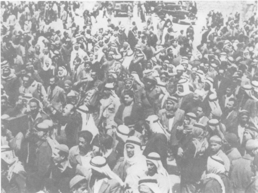
'Abd al-Qadir's funeral at the Mosque of the Dome of the Rock in Jerusalem, 9 April 1948.

Presently the shelling stopped. A large Jewish force advanced on foot through the western forest toward the mukhtar's house and the mosque—the latter destroyed in the course of the intense shelling. This was a golden opportunity for us, as the enemy was now exposed to our fire. We saw a number of them fall, but for a while they did not return our fire since their main objective at this stage was to occupy the summit of the village and to clean it up. After a while, another large